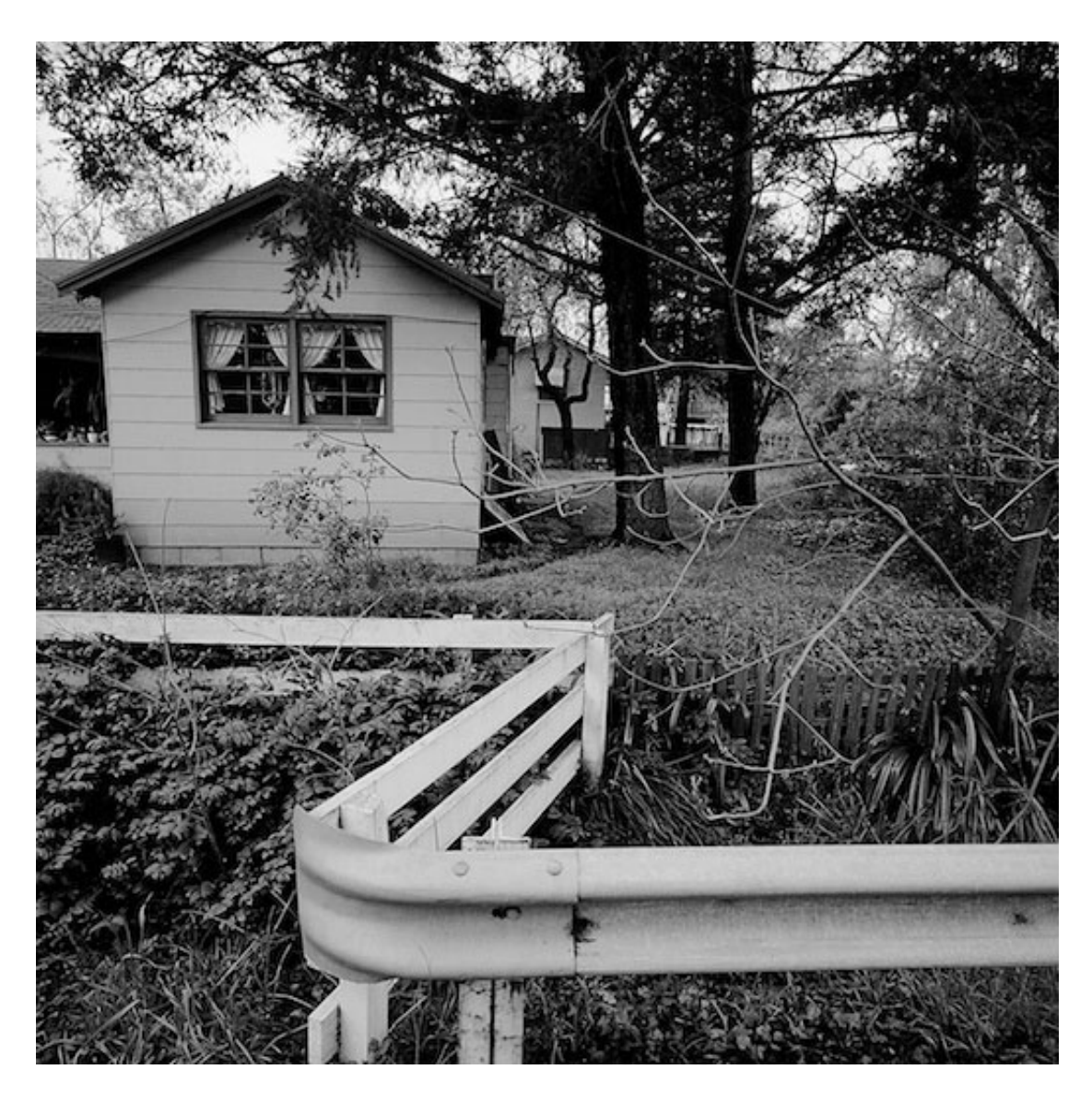
Neal Rantoul, Guard Rail #2, Yountville, CA, 1982 from American Series.