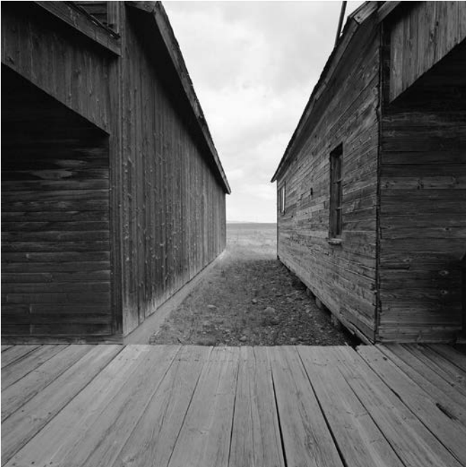
OLD TRAIL TOWN, CODY, WYOMING, 2005