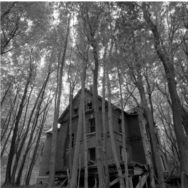
PEDDOCK'S ISLAND, BOSTON HARBOR, 2005

They are scrutinies of textures . . . both the finest and fiercest texture of all, time. . . Looking at these images, one thinks of Atget: the solidity, the seriousness, the unwavering gaze.