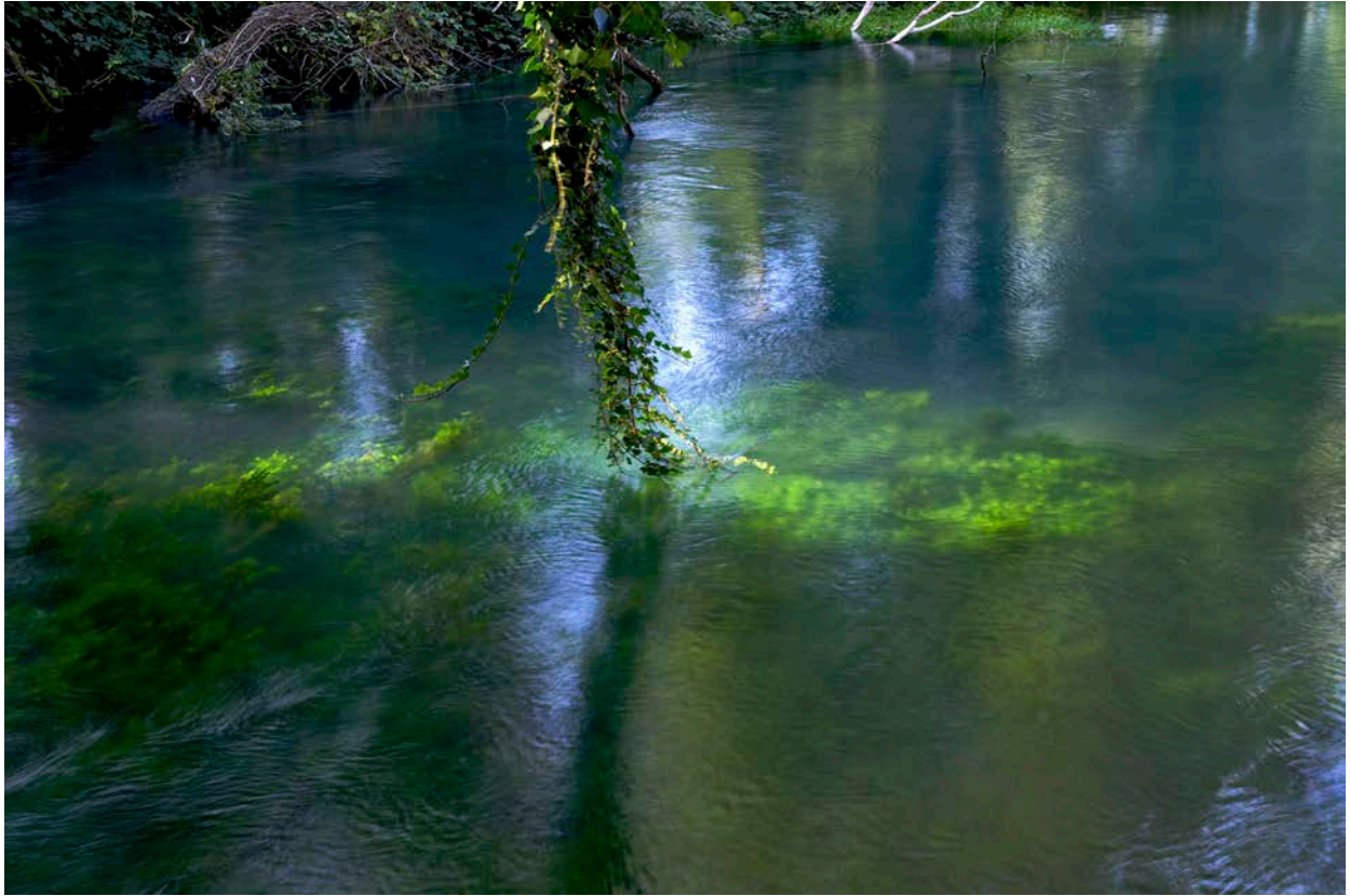
NEAR TRIESTE, ITALY, SEPTEMBER, 2009